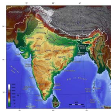
Map of India

India's climate is tropical. The Himalayas and peninsular shape of