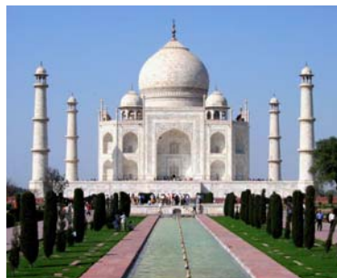
Taj Mahal (17 th Century)