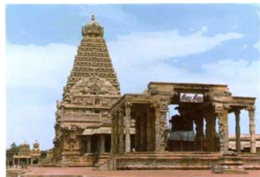
Tanjore Temple (11 th Century)