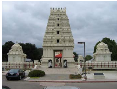
Malibu Hindu Temple, CA