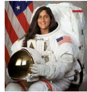
Sunita Williams, Astronaut

Some Indian American names are well known to general public: Deepak Chopra, Zubin Mehta, Sunita Williams, and Bobby Jindal. However, many more have achieved extraordinary accolades like Nobel Prize, but are not well known outside their area of expertise. These include, H.G Kohrana, Mira Nair, S. Chandrasekhar, CKN Patel, Kalpana Chawla, Indira Nooyi, Vinod Khosla, Fareed Zakaria, Kamala Harris, & Ramesh Ponneru.