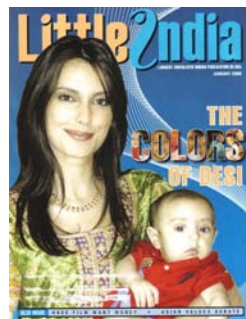
Little India, Magazine